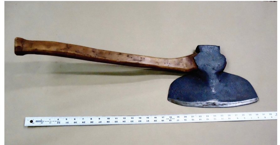
This is my favorite broad axe, used to hew most of the logs for our house. The hickory handle is bent away from the blade, to give clearance for your hands passing the hewed log surface. The maker is unknown.

A few excellent axes, with uses and comments. Availability is always the question.